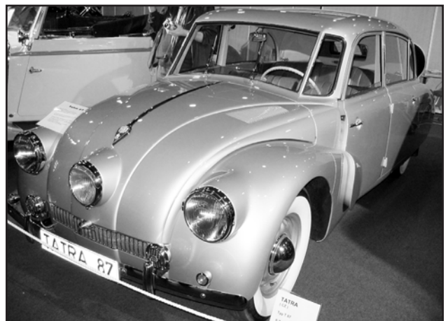
Tatra T87.

You are in for a real treat when you see this car. When I visited in late July, I walked around and around this superbly designed art work in wonderment and Czech pride. Admission to MIA is free. Read all about the car in the January 2008 archived edition of Slovo by visiting our website at < www.sokolmn.org >. Learn more about Tatras at < www.tatraworld.nl/ >.