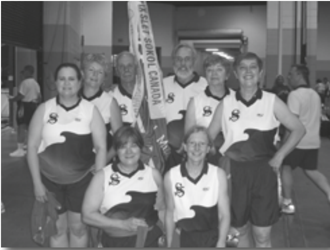
Sokol Minnesota Slet Team