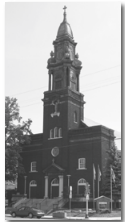
S.S. Cyril and Methodius Church, Mpls, MN

The CGSI searchable online database will be available to CGSI members as soon as the transition to our new website is complete. Many churches are complete and ready to go. Others still in process will be added as they are completed. The microfilms are part of CGSI's library collection and the actual complete records may be viewed at the MGS Library, 1185 N. Concord Street, South St. Paul MN 55075. Keep watching www.cgsi.org for updates.