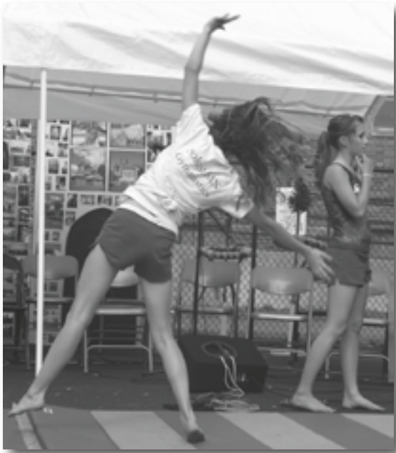
Sokol Minnesota gymnasts performing at the 2008 Fall Festival

In preparation for our annual competition, team girls learn a routine from the USA Gymnastics for floor, balance beam, uneven bars, and vault. This year we competed in the Western District competition in Cedar Rapids, Iowa. All of the girls did really well; they placed from first to tenth. Our team came in first place as a group, and team members placed with individual medals and trophies! We have fourteen team girls though we are limited for space at our C.S.P.S. Sokol Hall. We don't have a full size floor and have one spring board lane to do our floor routines on, so we use Gleason's Gym Club where they can work on their floor routines on a full size floor. This greatly helps them increase their floor skills!