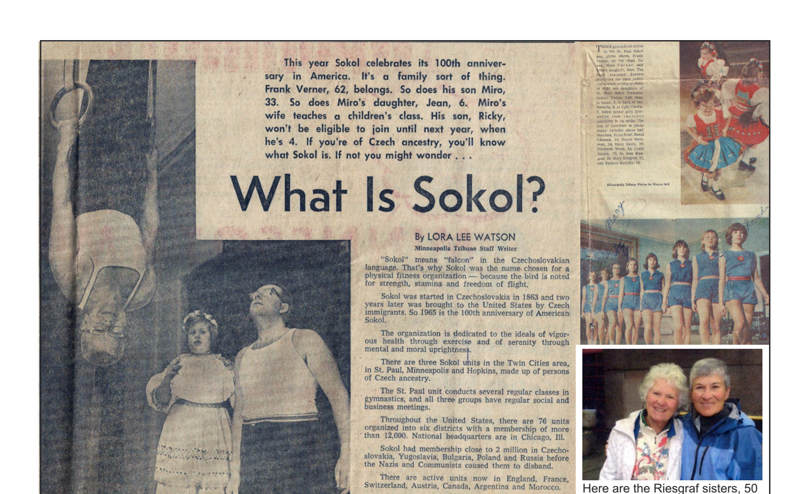
Lower age limit for Sokol gymnastic participation is age 4. There is no upward age limit. Children of members may participate free except for an insurance charge. The gymnastic classes are not limited to members of February 21, 1965, Minneapolis Tribune article saluted 100 years of American Sokol.