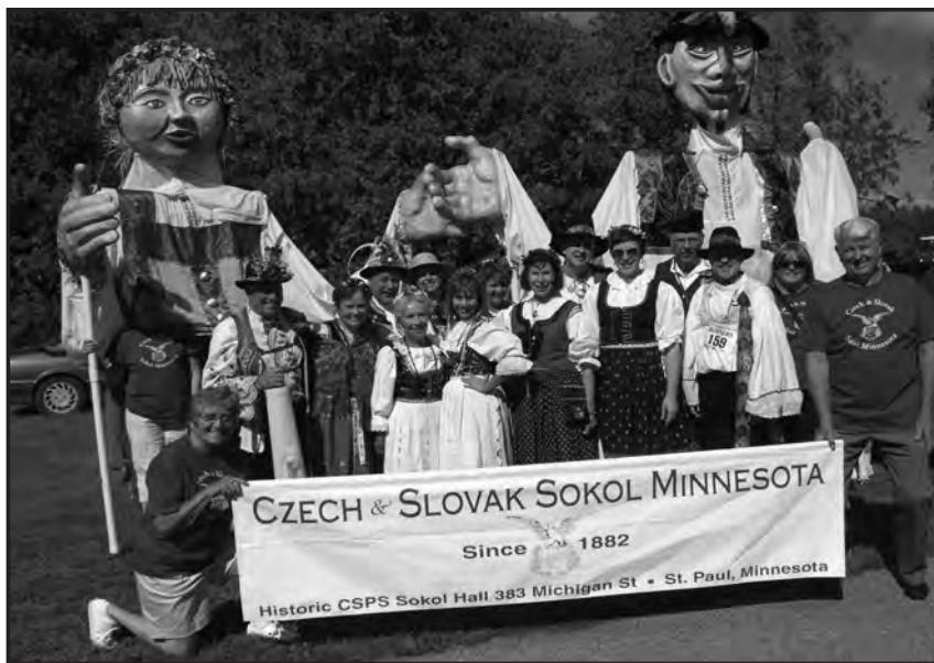
Sokol Minnesota members (folk dancers, prostna athletes, and puppet handlers) in the parade line-up for the 150th anniversary celebration for St. Wenceslaus Church, Spillville, Iowa, September 4, 2010.