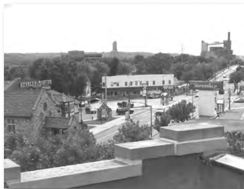
Looking out West 7th Street from above our 3rd level mezzanine, we see the Schmidt Brewery.

There are places and spaces I've never been to in our hall, and each week a new opportunity arises to explore. And rise we did! The week of the Republican Convention, I distracted myself from all the commotion with a request from the architects who are developing a Historic Structures Report (HSR) for us. The HSR