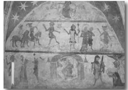
Romanesque Chapel, Hosin

The original small church is Romanesque, dating back to the 1100's. Its simple plaster walls and arched ceiling are covered with primitive paintings depicting several saints and angels. A magnificent and very old porcelain statue of the “Pieta” remained in the chapel. The original baptismal font was kept in a covered alcove off the side door.