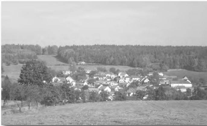
Dobřejuvice, Czech Republic

Nearby was Dobřejuvice, birthplace of our maternal great grandfather Václav Plojhar. This was the beautiful country the emigrants were so sad to leave. It was easy to understand their feelings. A cluster of red-roofed cottages nestled protectively in a shallow valley as two rounded hillsides folded together. Small apple orchards grew at the top of the valley and a country road rolled out of the lower end toward the village of Hosin.