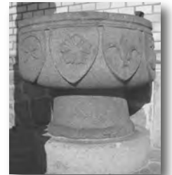
Baptismal font, Hosin

Now it was our turn to say goodbye to Dobřejuvice. We got back on the road headed for Malešice, birthplace of our paternal great-grandmother. We found house #18 as listed on her baptismal certificate and were taking pictures when a young lady came out to the courtyard door to ask why. When we explained, she invited us into the courtyard. The house, buildings and courtyard walls were old and crumbling, but the lady and her husband were working on restoring it. It was exciting to see the interior of the courtyard unchanged since our ancestor's time. We gave the homeowner pictures of our great grandmother, copies of the baptismal certificate and family tree. She was thrilled because she was interested in the house history.