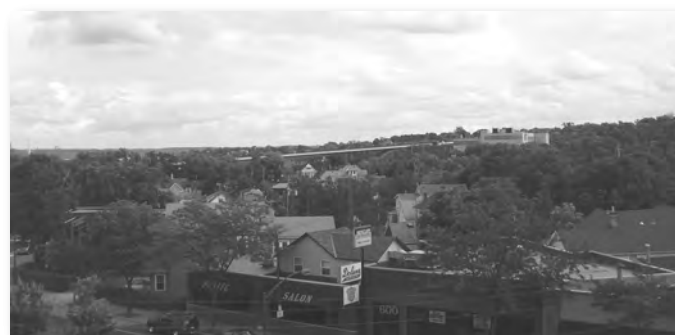
Looking south above the CSPS Hall, the High Bridge underscores the horizon.

Putting the Report on our website will make it a living document that can be updated as we complete project, so that members and others can track our progress. This is valuable