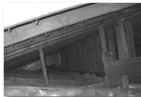
Joists and rafters and insulation above the hall stage. If you look closely at the top right, you see the cord that connects to the wood block and pulley system for the "disco ball"!