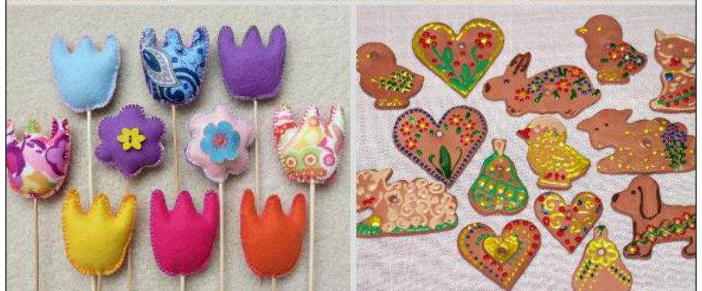
Donations from the Czech and Slovak school families