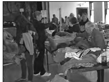
Popular sellers: jeans, for kids and adults, and vintage dresses.