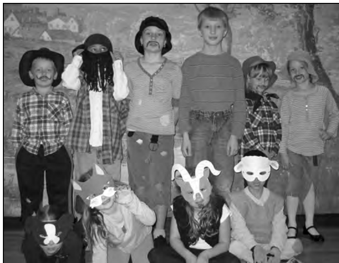
Several of the Czech and Slovak children, in costume, posed on stage at CSPS Hall on April 7 after their performance of Brémští muzikanti for the Family Easter Saturday.

Encouraged by their children's excitement to participate and share their gift of language, the moms are hoping to incorporate more music as well as more contemporary plays in the future. They hope that some day the children will be inspired to help write theatrical scripts for well-known Czech/Slovak stories. Aware of the impact drama has had in the history of the nation, the Czech and Slovak moms look forward to seeing the positive effects of drama on their children, as well as their audiences.