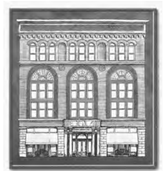
Bohemian National Hall 1897-1997