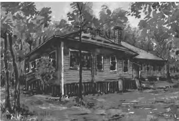
Watercolor of pencil sketches from a group of 20 by Ferdinand Uebel at Sokol Camp, Pine City, 1954-58.

Sokol Camp is also a great jumping off point for day excursions. The Northwest Company Fur Post historical reconstruction is just west of Pine City. Hinckley, with its casino and fire museum is 15 minutes north. There are several golf courses nearby and Duluth is less than two hours away.