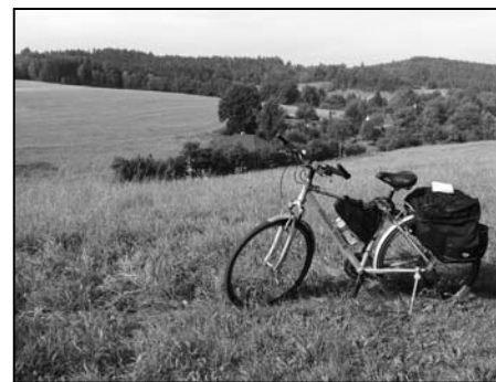
A stop to admire the beautiful view.

He rented a bicycle in Prague and spent seven days pedaling 400 km (250 miles) in Bohemia. His goal was to visit his ancestral village of Nová Bystřice in southern Bohemia, on the border with Austria. He found no relatives; all had immigrated to the United States or had gone to Austria. He biked, on his own, from Prague through Průhonice, Týnec nad Sázavou, Tábor, Jindřichův Hradec, Nová Bystřice, Slavonice and back through the same towns to Prague.