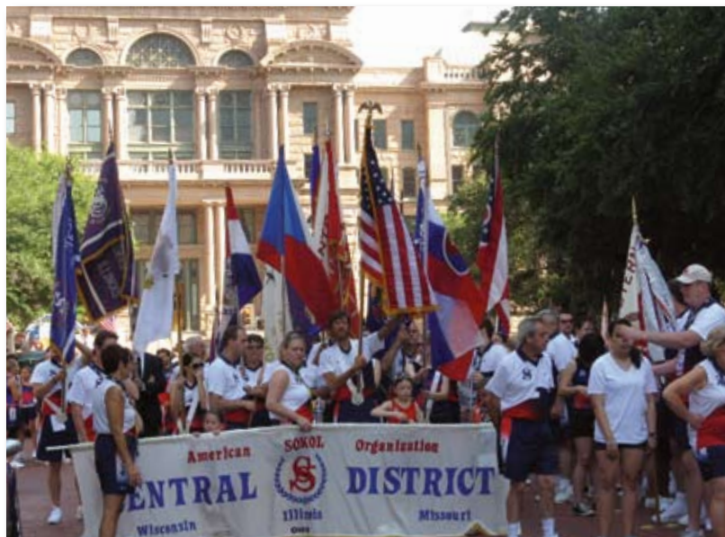
Ft Worth 2009 Slet

We at Sokol Minnesota display six flags: our nation, the United States of America flag, the Czech flag and the Slovak flag to honor our heritage, the flag of the State of Minnesota, the international Sokol flag, and our unit flag. The unit flag has changed over the year as we have changed our from Sokol Zizka to St. Paul Sokol Gymnastic Society, then to Sokol Minnesota, and finally to Czech and Slovak Sokol Minnesota.