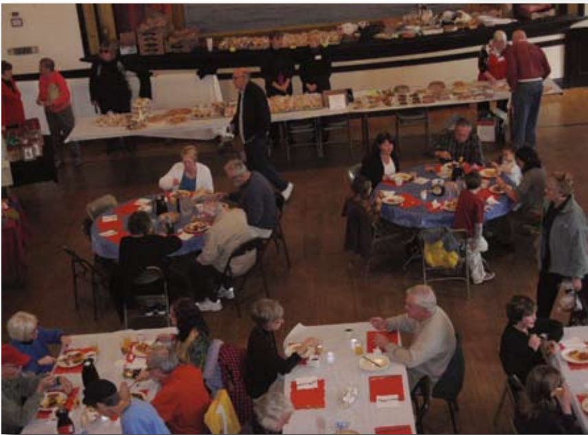
Pancake breakfast from the third floor gallery