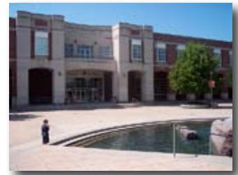
Nebraska Union – Lincoln CGSI

Look for Part III of Slovak Surnames: What They Can Tell A Family Historian in the February 2010 SLOVO.