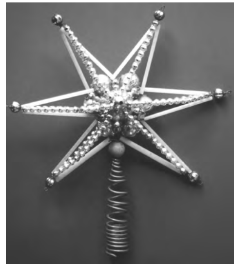
Kelsey Ornament Collection: Unusual tree topper, most likely used on tabletop tree; c1926-1950.

Once part of the vast Austro-Hungarian Empire, Czechoslovakia was named following World War I and has the longest tradition of glassmaking on the continent. The industry was centered in Gablonz, a tiny village located on the Niesse River in a valley of Bohemia's Iser Mountains. Gablonz had all the natural resources needed to make glass. Equally important, it was located near important trade routes and business centers, so that it was accessible to the influence of Venetian artisans. Initially they worked only with colored, hollow glass tubes heated over fire-lamps and shaped with molding tongs. Soon, inspired by the master glass artists of Venice and Murano, they turned out beads of every description: blown, drawn, spun, marbled, painted, faceted, engraved, hand cut, wound and press-molded beads that could be given a satin-like finish, and even lined with gold or silver.