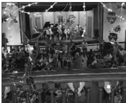
Left: From the balcony, a scene of dancers and musicians below.

exceptional New Orleans style jazz. A predominantly non-Sokol mix of guests were introduced to our historic Hall. Devotees of Butch's music and West End neighbors heard jazz classics, which are also popular in the Czech and Slovak Republics.