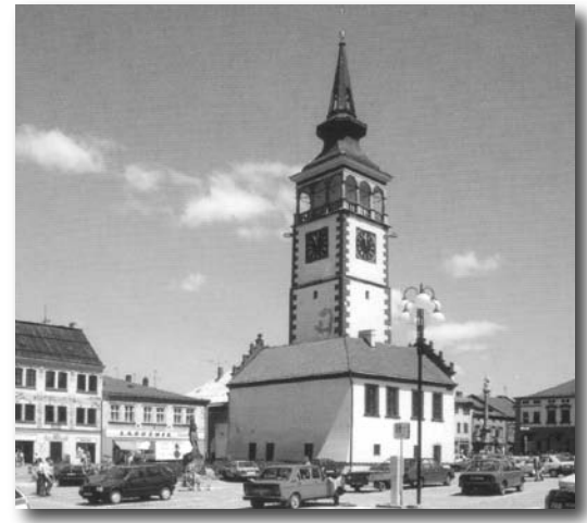
Dobruška Town Square

The next day we hiked through Adršpašské skalní, a park with fascinating sandstone rock formations, and visited a monastery in Broumov with a library of ancient hand-scribed books. Sunday, after six hours of class, we took a walking tour of Dobruška, climbed the town hall tower, saw a local museum, and attended a rock concert on the town square--plus ate a lot of dumplings. Over the next three days we had ten more hours of class, and went on a 14-hour sightseeing tour to a UNESCO historic site, Kunětická hora, with 13th century castle ruins undergoing restoration and archeological exploration. Then we stopped at the pernický (gingerbread) museum, and the Litomyšl Castle, famous for the faux stone plaster relief work that simulates decorative stone blocks. No two are the same! From there we went to the home of Czech composer, Smetana. On July 31, the mayor, two senators, and officials from the Ministry of Education and Charles University came for a formal reception. They welcomed us with speeches and a nice musical program, and in turn we sang two Czech songs for them. Everyone welcomed us like returning family.