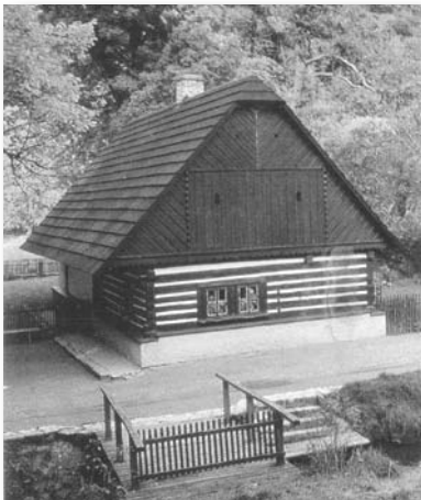
Grandmother's house, in Babiččino údolí

Saturday we went up in the Orlické hory or Eagle Mountains. We stopped at a craft fair in Deštné, a village famous for its glass blowing and special green glass. It was like a postcard, with Heidi-like houses tucked into the valleys and flowers everywhere. We saw Masaryk's mountain cottage and hiked on a mountain trail. Blueberry bushes were thick along the trail, so my roommate and I gobbled berries as we walked, returning with blue hands and mouths. After Sunday morning class, we went to a large fair in Opočno where we enjoyed many local artisans in native dress making and selling traditional crafts.