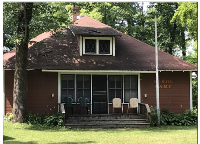
Sokol Camp Lodge in Pine City

Check the August Slovo for event status in connection with Minnesota Department of Health social distancing restrictions to reduce the risk of COVID-19.