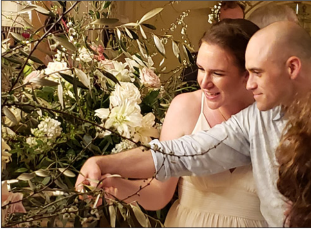
Cutting the wedding cake (behind the flowers!)