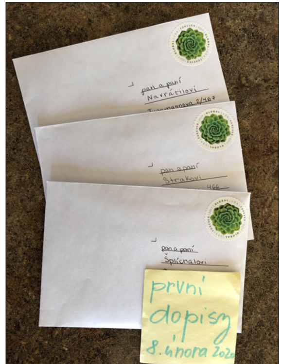
The first set of letters to Czech grandparents sent on February 8, 2020.

I know my grandparents love hearing from me in Czech throughout the year, whether it's through email, phone calls, or letters. This leads me to our most recent škola project. Over several recent weeks, we have been writing letters to our grandparents and ultimately using the letters to both