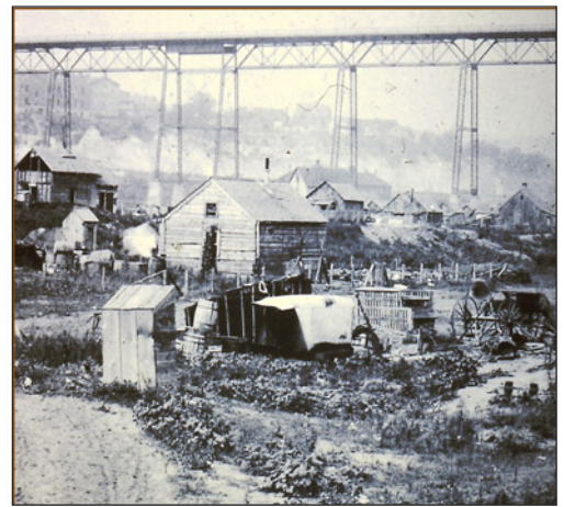
Saint Paul River Flats in 1880