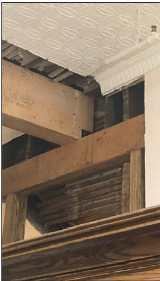
New structural support beam under the main stairs to the second floor

Czech and Slovak Sokol Minnesota provides fitness and community for individuals and families through physical, educational, cultural, and social programs for children, teens, and adults.