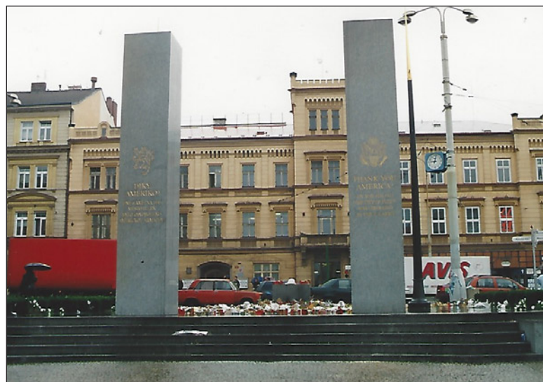
Above: The Thank You American Memorial, renovated in May 2018, consists of two stone columns with inscriptions in both Czech and English:

THANK YOU AMERICA! ON MAY 6TH 1945 THE CITY OF PLZEŇ WAS LIBERATED BY THE US ARMY