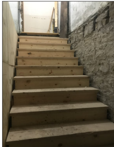
New stairway from the basement to the first floor