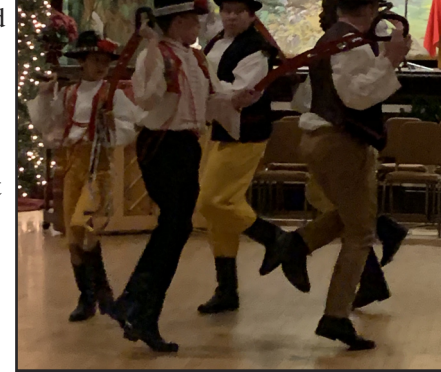
Taneční Teens boys' dance