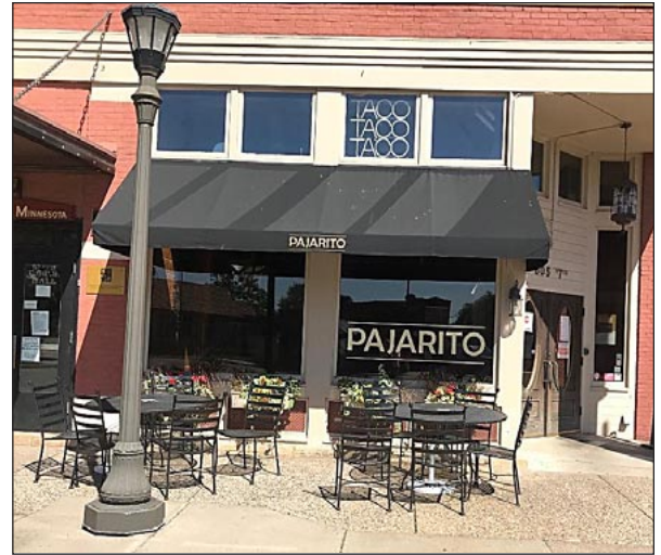
Pajarito Saint Paul at the C.S.P.S. Hall.

Pajarito is currently open Tuesday through Saturday from 4-9 p.m., and offers both dine-in and carryout options that are safe and socially distanced. To order online or to make reservations, visit: www.pajaritorestuarant.com