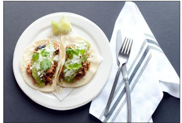
Carnitas tacos made with slow-simmered pork and topped with avocado-serrano sauce, onion, and cilantro.