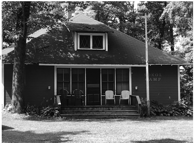
Minnesota Sokol Camp Association lodge in Pine City, Minnesota