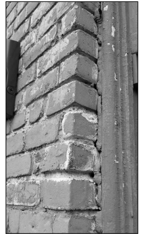
C.S.P.S. Hall brickwork needs tuck pointing

If you would like to help complete this grant match, you can contribute online at www.SokolMN.org , or send a check made out to Sokol Minnesota to 383 Michigan Street, Saint Paul, MN 55102.