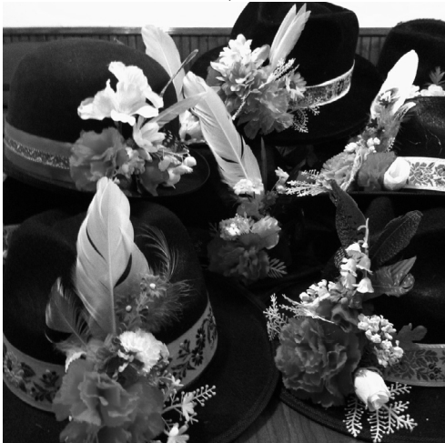
Newly decorated and refurbished dancers' hats