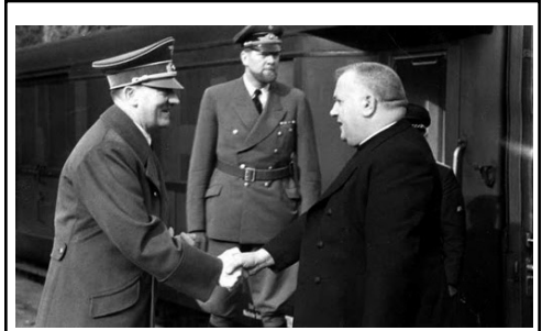
Adolf Hitler (left) and Jozef Tiso (right) shake hands. Tiso was the leader of the Slovak State during the whole of World War II. He represented the more moderate wing of the state's single governing party but was nevertheless an autocrat and a collaborationist who oversaw the export of over two thirds of all Slovak Jews to their death in concentration camps. Others in the party were even more aggressively pro-Nazi. The Slovak National Uprising was staged primarily against this Slovak government.

The National Council drew into its effort the commanding officers of important units of the Slovak army, infiltrated the government (for example, the governor of the National Bank systematically diverted funds for use by the Uprising), recruited tens of thousands of partisans, negotiated with the Czechoslovak government-in-exile in London and the