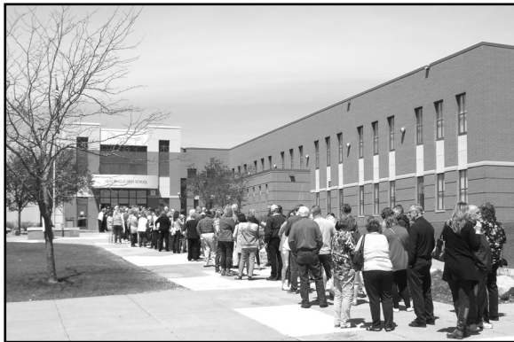
Sellout crowd at New Prague screening of Singin' in the Grain .