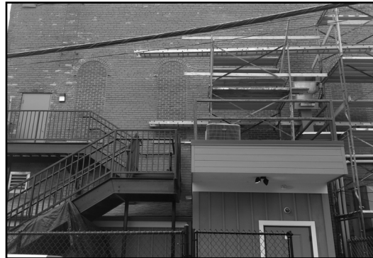
During construction; shows the bricked-in windows.

www.Sokolmn.org or send a check made out to Sokol Minnesota to 383 Michigan Street, Saint Paul, MN 55102.