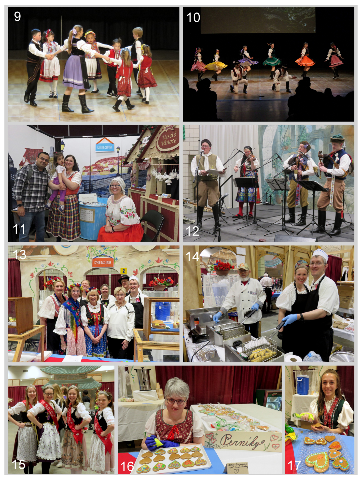
August 2019 Slovo 5