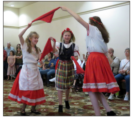
Red handkerchief dance

The Sokol Minnesota Children and Teen Dancers were invited by the National Czech and Slovak Museum and Library in Cedar Rapids, Iowa, to perform on May 18 for the community Houby Days festival. The children and their parents were very excited for the opportunity to perform and to see the exhibits at the museum. They had been invited to be in the morning parade and perform twice on the outdoor stage. However, the weather did