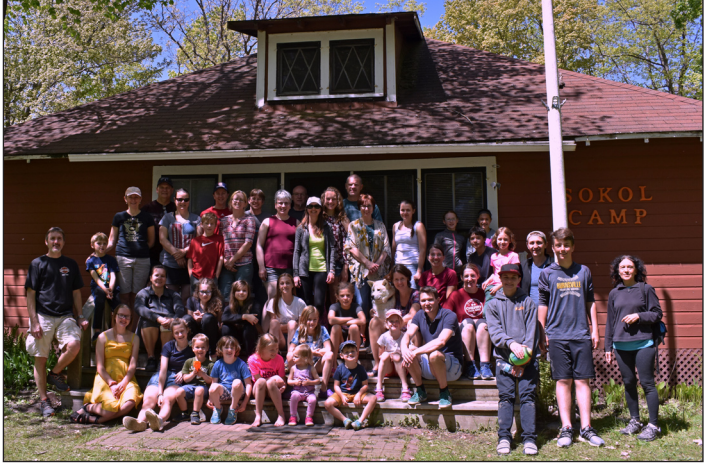
Over 50 members and friends of Czech & Slovak School Twin Cities attended the 6th annual get together at Sokol Camp.

Sokol Camp in Pine City has been enjoyed by generations of Czech and Slovak descendants for its tranquil setting among the trees on the shore of Cross Lake. While one can seek an opportunity for a quiet getaway there, the group of members and friends of Czech & Slovak School Twin Cities filled the camp over Memorial weekend with the sounds of happy children running free, conversations both in Czech/Slovak and English, games played inside the lodge as well as on the large grassy areas, and songs