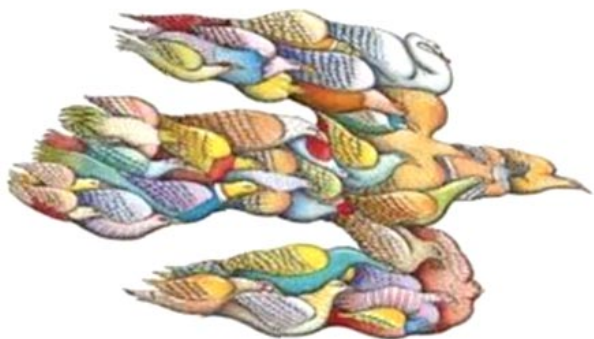
Illustration by Peter Sís.

Sís’ rendition of the story begins with all the birds of the world getting together for a conference. Each of them represents a human fault which prevents humankind from attaining enlightenment. The hoopoe bird, a symbol of virtue in Persia, tells them of concerns similar to those in today’s world: “Birds! Look at the troubles happening in our world! Anarchy-discontent-upheaval! Desperate fights over territory, water, and food! Poisoned air! Unhappiness! I fear we are lost. We must do something! I’ve seen the world. I know many secrets. Listen to me: I know of a king who has all the answers. We must go and find him.” The birds begin an epic and perilous journey over deserts, mountains, oceans, and seven valleys (of quest, love, understanding, detachment, unity, amazement, and death).