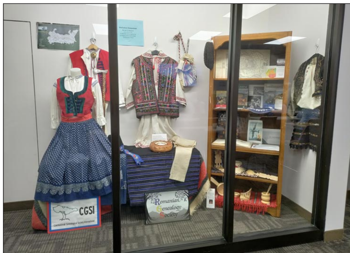
Kroje and artifact display at the Wallachian Connections event.

Czechoslovak Genealogical Society International and the Romanian Genealogy Society held their "Wallachian Connections" hybrid event on August 26 in Mendota Heights. The free member event examined the shared heritage, culture, and migration history of the Czech Moravian area of Wallachia, the Carpathian foothills of Slovakia, and the Romanian region of Wallachia.