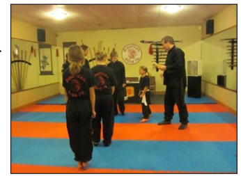
Youth Kung Fu class

For questions, to learn more, or check on the start date: email AmericanKungFuNorth@gmail.com