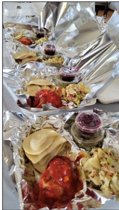
Four takeout dinners

Over the years, the cooks adopted a few shortcuts, like finding a used multiple-stacking Chinese steamer to quickly cook the cabbage and pirohy , which helped off-set the time it took to dip each pirohy in butter.