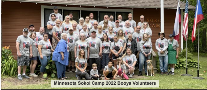
Minnesota Sokol Camp 2022 Booya Volunteers

Sokol Minnesota brothers and sisters and friends, it's not too early to plan for upcoming summer events! There are plenty of opportunities to enjoy a beautiful day or weekend up at the camp, including fellowship with others in volunteer positions. We are always in need of volunteers for set-up, food/beverage serving, and tear-down and clean-up.