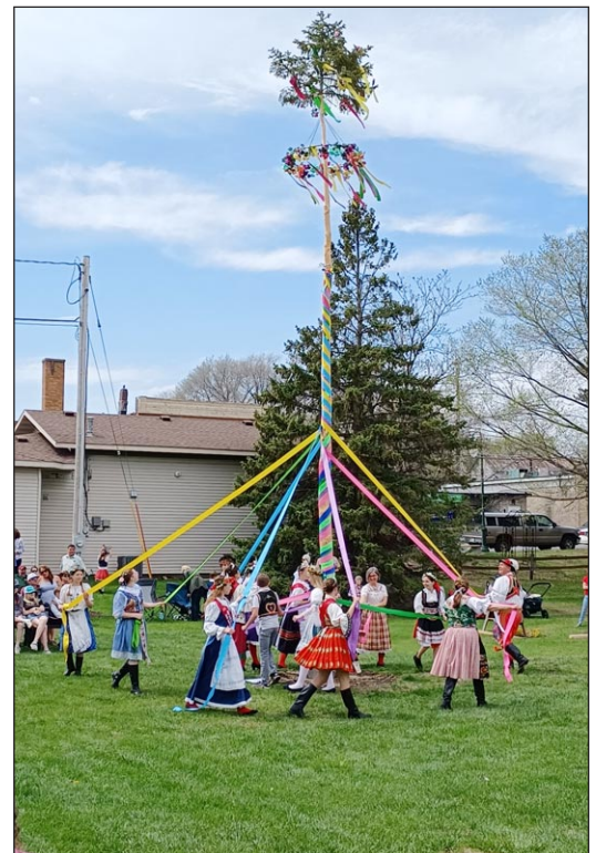
May Pole Dance

We invite everyone to join us for May Day 2024 on May 5.