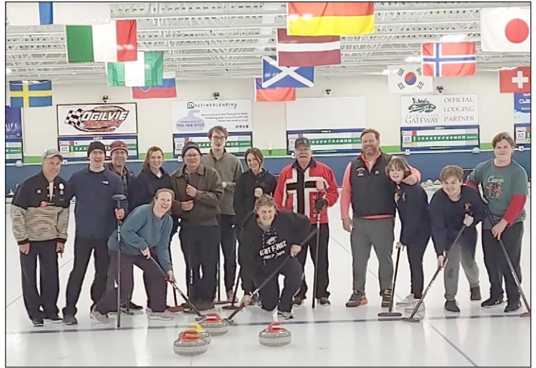
Cross-Cultural Curling group at Four Seasons Curling Club

Here's to connecting with others and keeping learning lifelong!