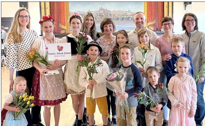
Czech language teachers and students.