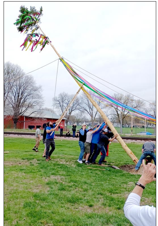
Crew raising the Montgomery May Pole