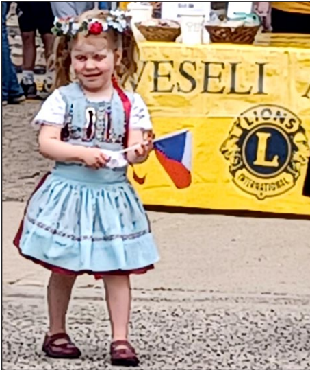
Young May Day fan in her kroj

Over 200 visitors enjoyed the Fifth Annual Czech May Day celebration in Montgomery on Sunday, May 7. Highlighting the afternoon festivities was the traditional raising of the 30' May Pole. The Pole was a pine tree, stripped of its bark leaving a small "Christmas tree" on the top. A flower wreath positioned just below the top with ribbons afforded a chance for many to dance around the May Pole, winding and unwinding the ribbons around the tree in the native Czech style.