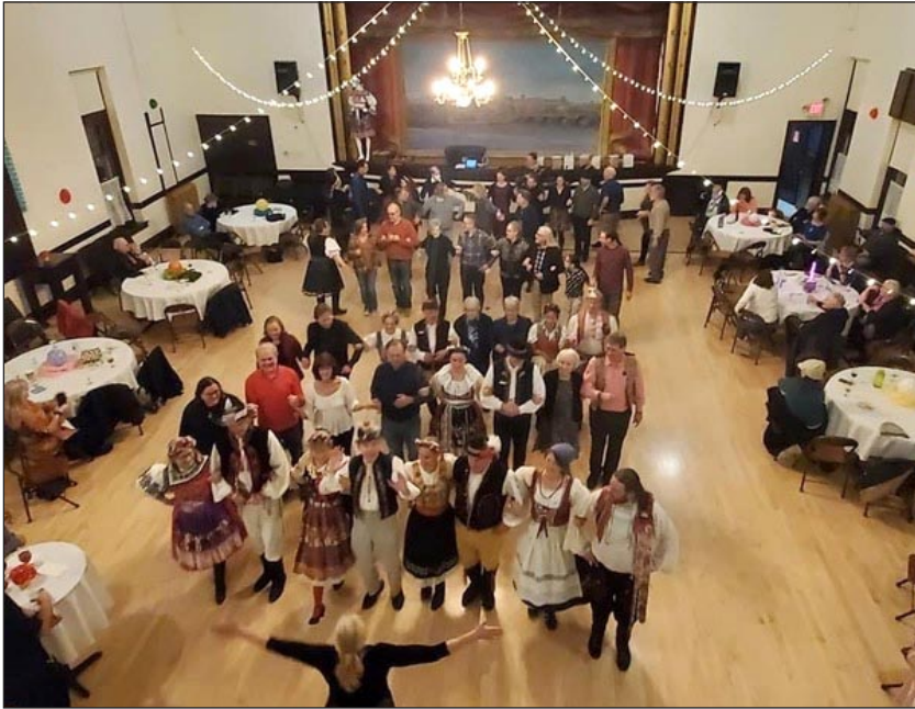
Grand March of guests and current and former dancers

On November 12, 2022, the Saint Paul Czech and Slovak Folk Dancers celebrated the 60th Anniversary of the founding of the group. After weeks of planning, the group and their guests were ready to party at the C.S.P.S. Hall. The celebration was a Double Dance, with two of the groups favorite bands.