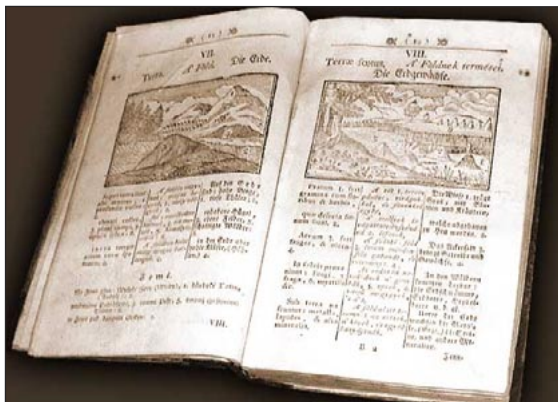
A Multi-lingual Edition of Orbis Pictus .

Knowing languages was important during your times and always after. You will be pleased to know we recognize how beneficial it is to support and improve all languages that connect us with our heritage or assist our knowledge-acquisition efforts. Translanguaging is the term we have for the process of using the entire language repertoire of a speaker in making sense of their lives. We have one world of knowledge that we describe with any and all words we have, no matter to what language they belong. Of course, you know that, given that your Orbis Pictus ( World in Pictures ), recognized as the first children's instruction book with pictures, was re-published in 1666 as a quadrilingual edition.