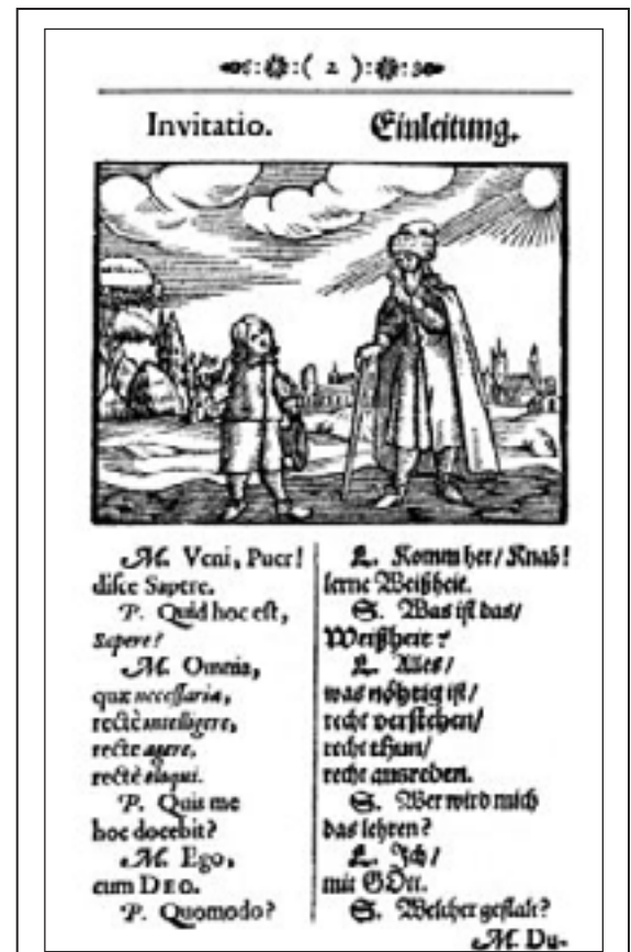
A Page from Orbis Pictus

"Come on, boy, and learn to be wise." Above the text we see the teacher and the student in dialogue. The student asks, "What does it mean to be wise?" His teacher replies, "Understand, act, and speak properly what is necessary." for " Orbis Pictus "