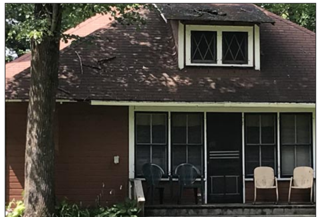
The tree (in front of lodge) in its earlier days