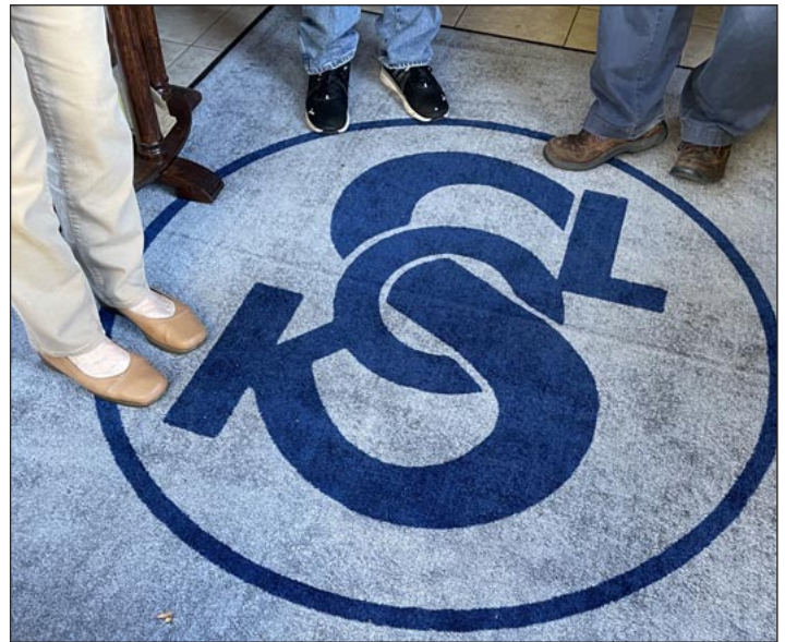
New welcome mat inside the west entrance of the C.S.P.S. Hall