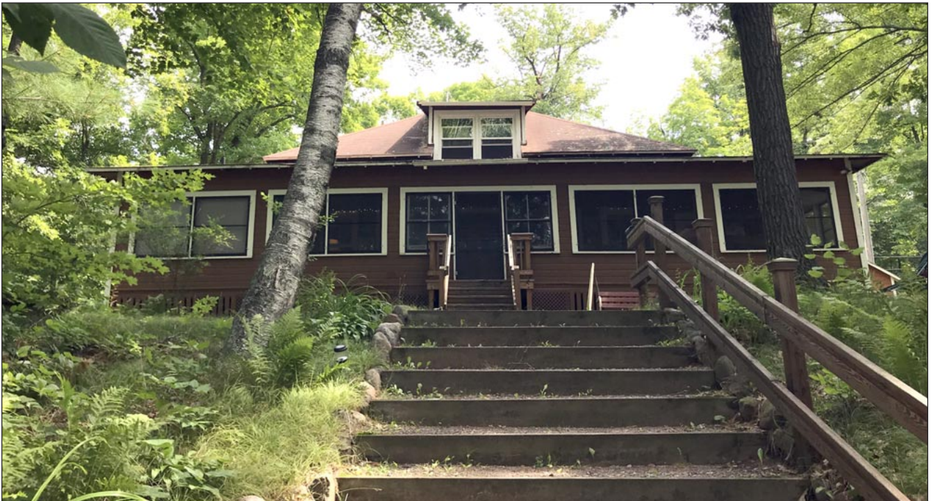
View of Sokol Camp from the dock on Cross Lake

Dear Sokol Minnesota Brothers and Sisters,