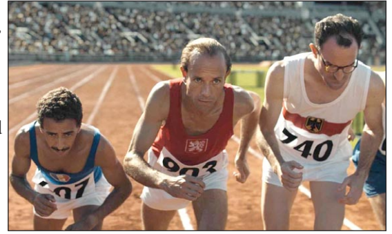
Emil Zátopek, the famous Czech runner (center).