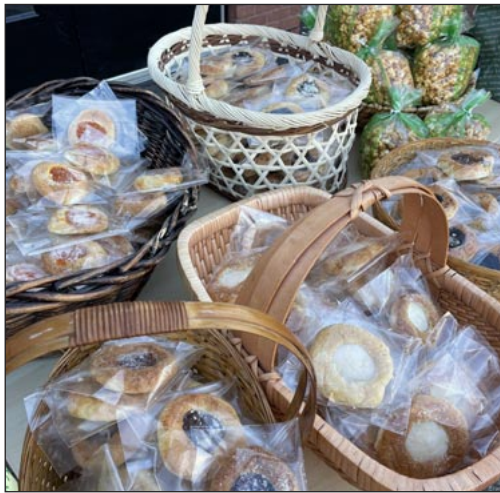
Koláče and caramel corn available for walk-up sales.