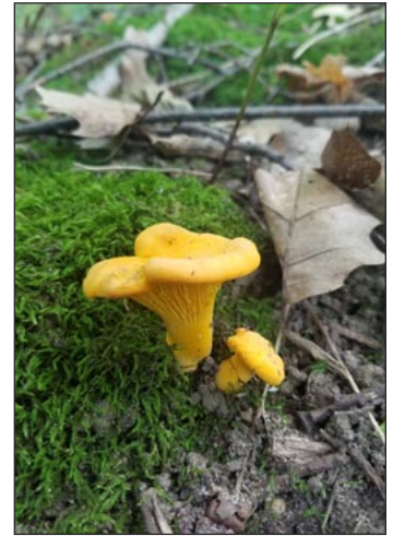
Chanterelle ( Cantharellus Cibarius )

For more houby information, please feel free to check out my website www.mojomushroom.com