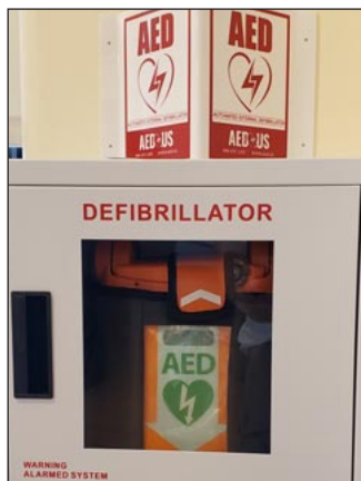
AED Unit Installed in C.S.P.S. Hall Dining Room

The Building and Properties Trustees Committee (BPTC) has been busy ensuring Czech and Slovak Sokol Minnesota's C.S.P.S. Hall remains a safe and inviting venue for events. It is available for Sokol Minnesota sponsored events as well as general public rentals.