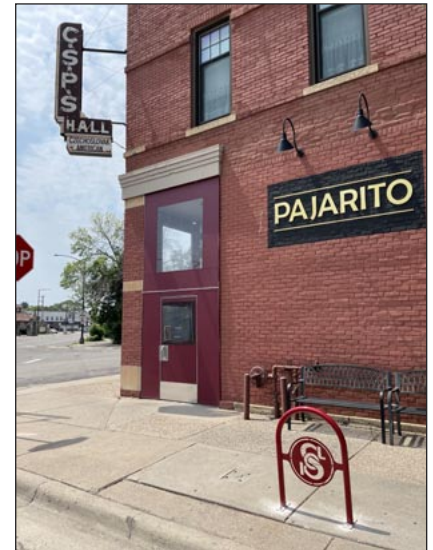
Bike rack on Western Avenue

After many months of work by a variety of people, together with financial support from the American Sokol Organization and installation assistance from the City of Saint Paul, bike racks at the Hall are now a reality. In addition to providing places for bikers to secure their bikes at the Hall, these racks display the traditional Sokol logo and are painted in Sokol red, proudly displaying the spirit of our organization. Many thanks go out to everyone who supported this effort! For more information on Kolo Sokol activities, see the Sokol Minnesota web site at sokolmn.org/bike .