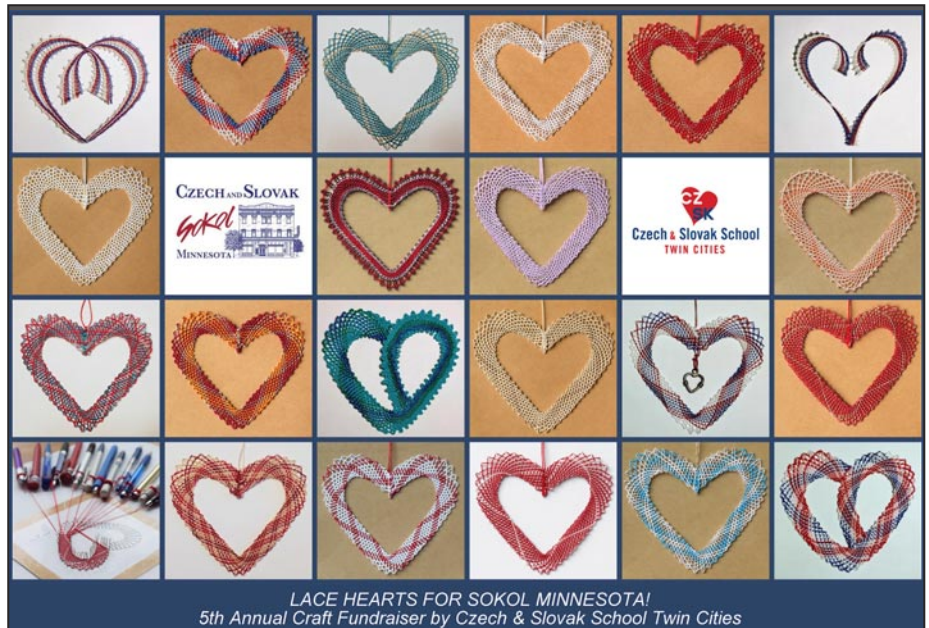
LACE HEARTS FOR SOKOL MINNESOTA! 5th Annual Craft Fundraiser by Czech & Slovak School Twin Cities