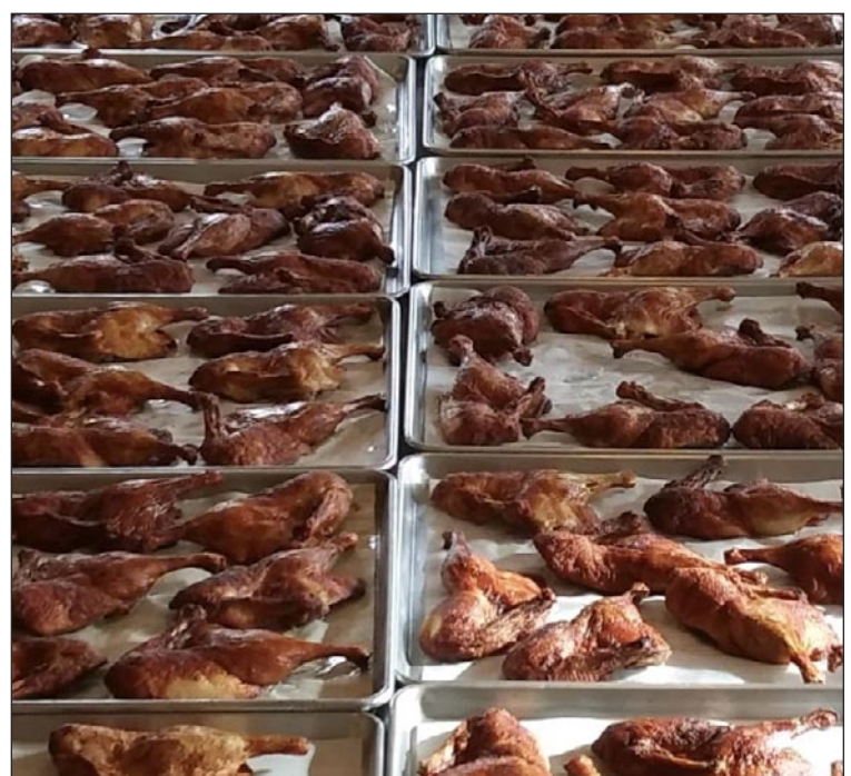
Delicious ducks on rows of trays.