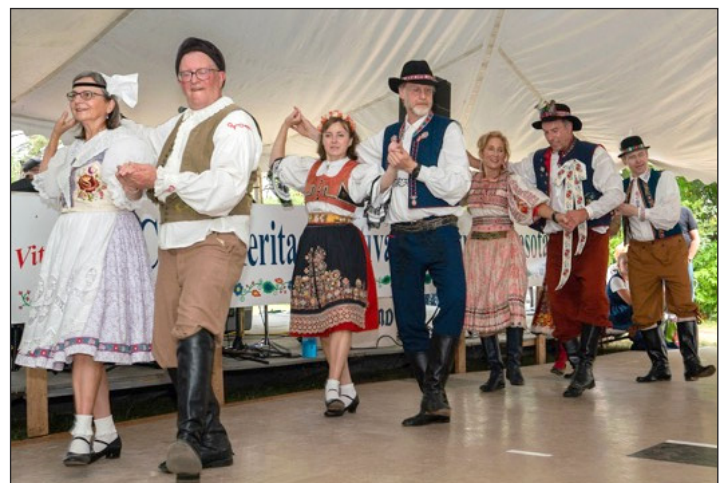
Performance in Bechyn.

The Saint Paul Czech and Slovak Folk Dancers was founded in 1962 to promote Czech, Moravian, and Slovak music and dance. Next year will be the 60th Anniversary of the beginning of our group. We plan to have an event to honor this milestone. We hope to see you all at performances soon.