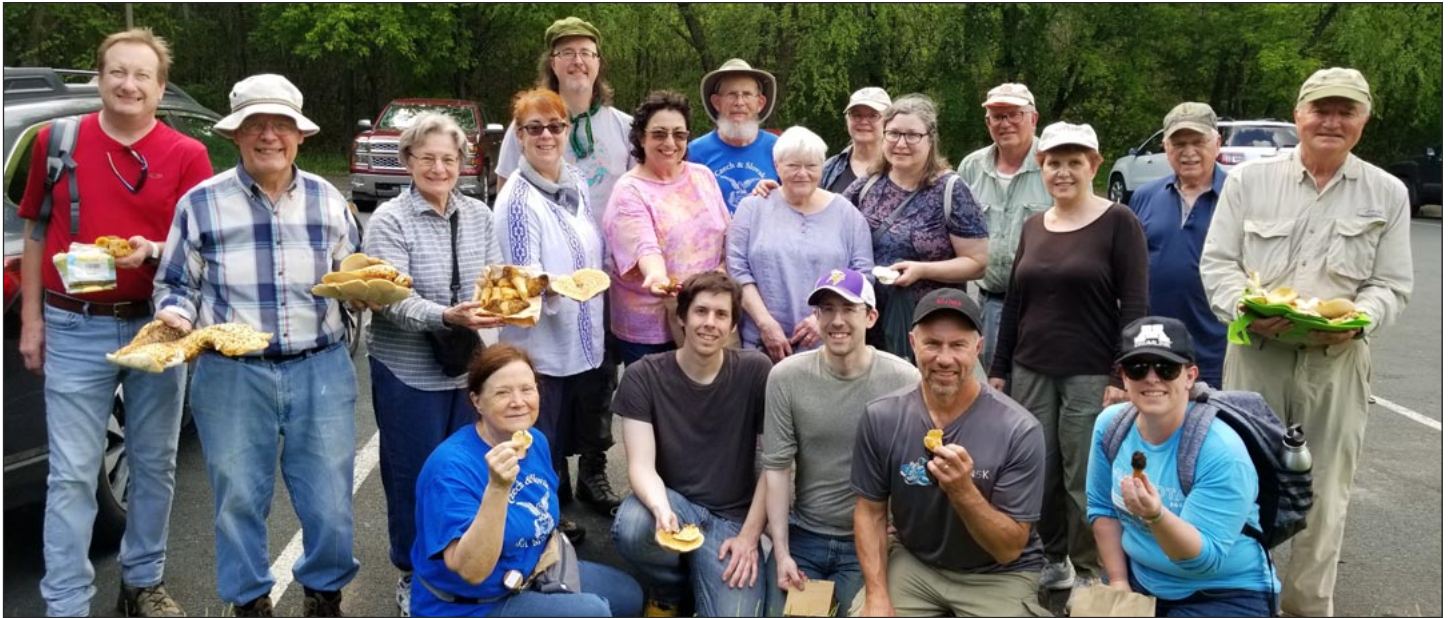
Mushroom hunters showing some of their finds