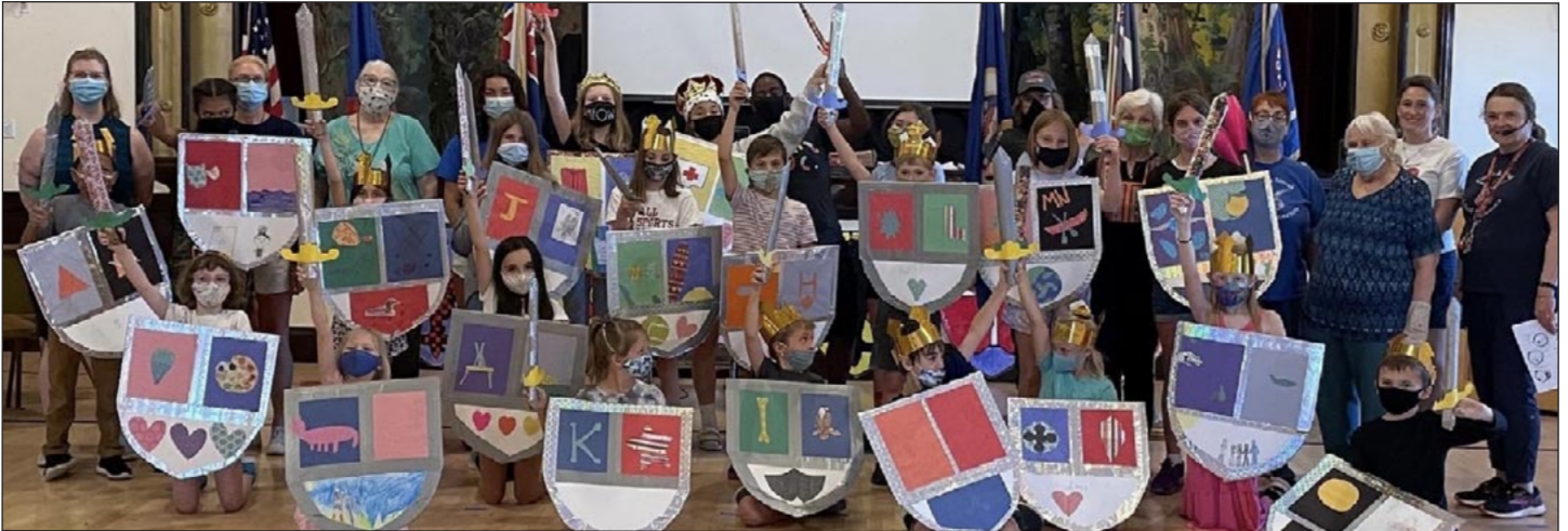
“Kings and Castles” volunteers and campers with their handmade swords and their own coat-of-arms on their shields