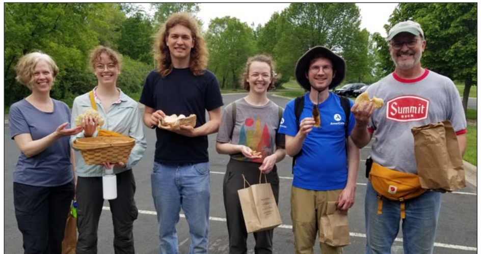
Happy mushroom hunters