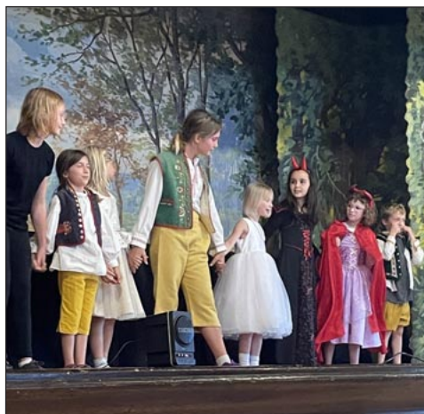
The Clever Princess play