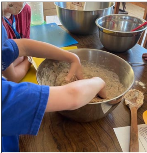
Mixing dough for Artisan Stone Ground Wheat Bread