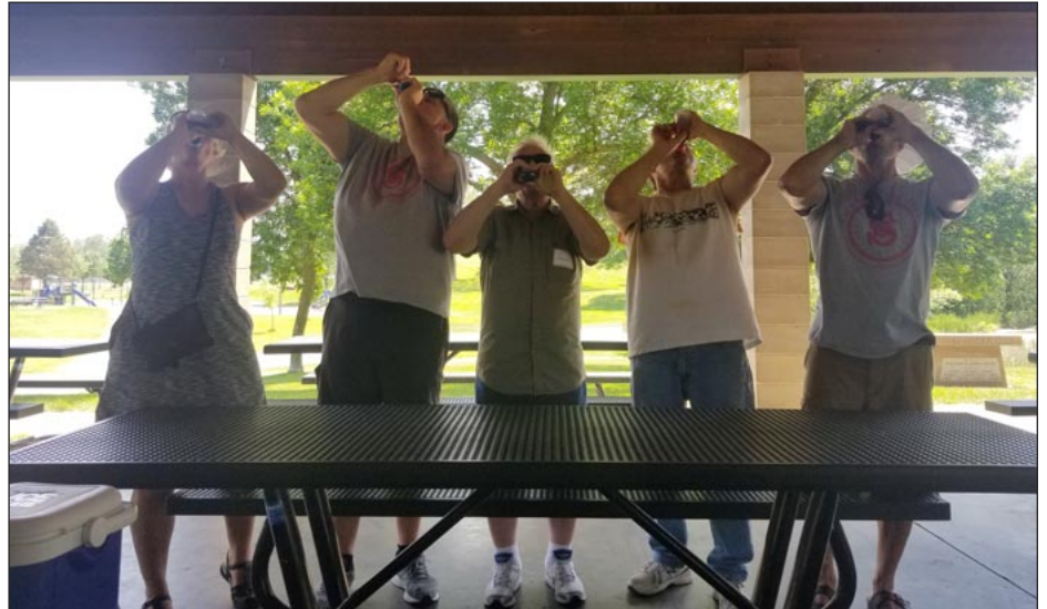
Bottoms-up! Root beer drinking contest from baby bottles