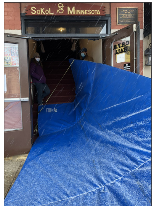
Where there is a will, there is a way.