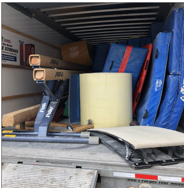
Sokol Omaha gymnastics equipment loading in process. The truck was full when it departed.