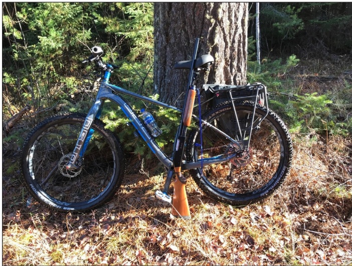
Tools for the "bike hunt"

The C.S.P.S. Hall is looking good after recent completion of the bar area structural work and remodeling.