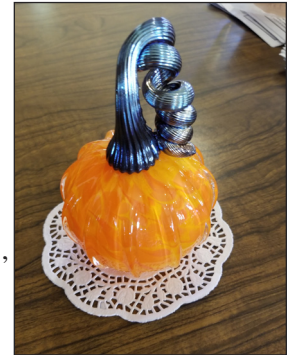
Glass pumpkin door prize