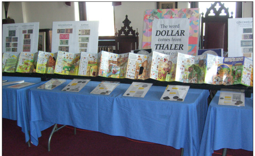
Czech, Slovak, and Czechoslovak money display.