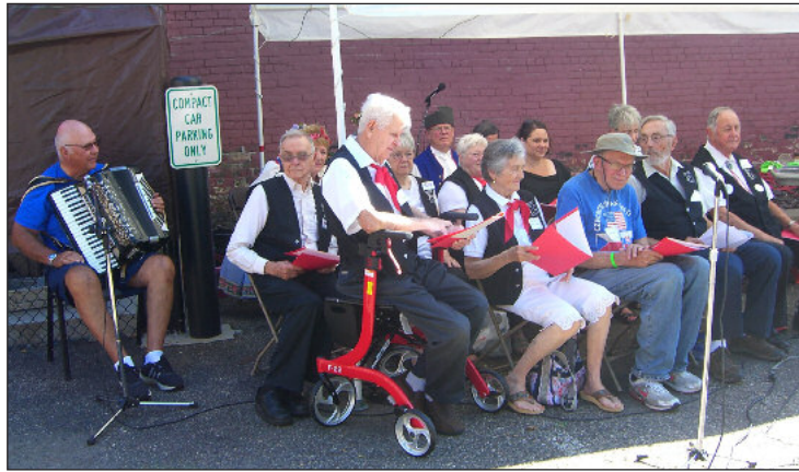
The Sokol Singers