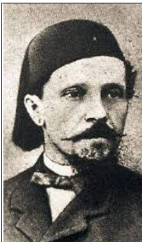
František Samuel Figuli

Figuli was an early Slovak arrival to the United States, coming well before the estimated 500,000 Slovaks who immigrated to the United States between the 1870s and early 1920s. It was not until the 1910 United States Census that Slovak heritage identity was recorded as part of the government's data gathering process.