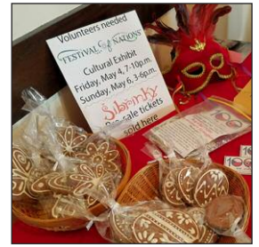
Perničky (decorated gingerbread cookies), info for Sibřinky , Festival of Nations, and the Czech-Slovak Century buttons