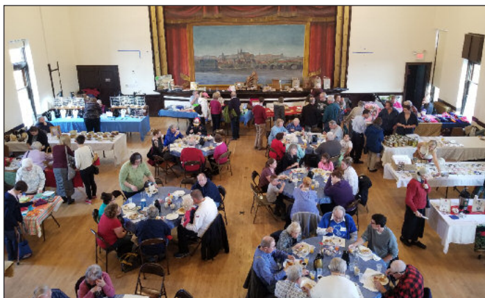
View from the balcony: happy eaters and busy shoppers.

We served 217 breakfasts (196 adult and 21 children) on November 19, 2017. This was one of our best attended breakfasts in several years. At the pancake breakfast in April, we served close to 120 individuals. Thanks to all who helped