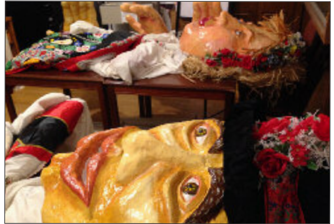
Jitka and Jarďa at the "Spa" (classroom at Sokol Hall) for their rejuvenation treatments before starting the 2018 parade circuit.

Our Sokol puppets Jitka and Jarďa have been in many parades and on display in many places over the years. Traveling takes it toll on these large, tall folks. They have suffered more than a few cuts and scrapes. After a bit of renewal time at the Sokol "Spa" in July, they are now ready to meet their fans again.