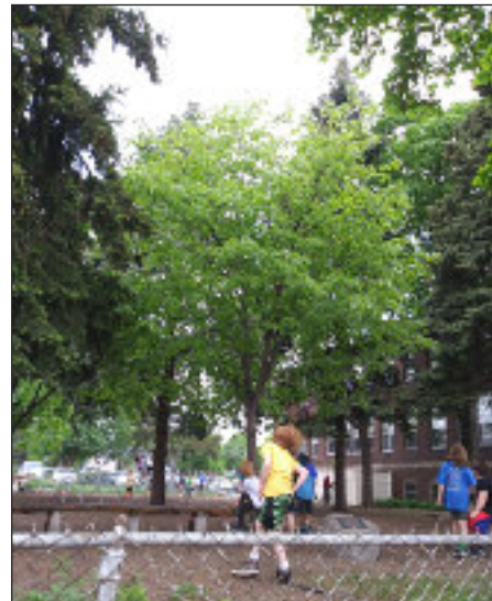
This linden at the edge of the parking lot at Saints Cyril and Methodius Church in Northeast Minneapolis is 25 years old.

historic parkway from Ljubljana to Trieste, some 290 lindens planted around 1810 survive. They were planted to mark the wedding of Napoleon Bonaparte to Austrian Princess Marie Louise. When Slovenia gained its independence for the first time in 1991, the country's national leaders met at the site of a more than 700-year-old linden known as The Najevnik . Each summer since then elected officials meet there.