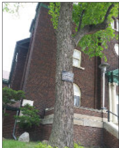
This linden at Saints Cyril and Methodius Roman Catholic Church in Minneapolis is approximately 100 years old.

In Slovak, Czech, and Polish cultures, historic lindens, with heart-shaped leaves, massive symmetrical trunks, and heights that typically reach 60 to 80 feet, are thought to have medicinal and spiritual qualities that date back to early Slavic times. All three cultures cultivate honey that bees produce from Linden flowers' pollen, as well as tea from the flowers.