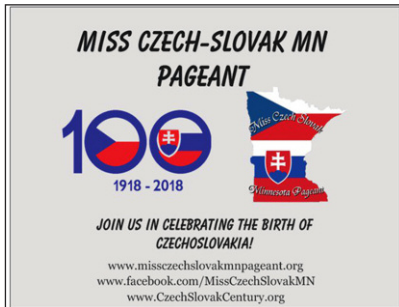
The special commemorative magnet for the 2018 Minnesota Pageant.

April 12-18, Minneapolis Saint Paul International Film Festival , St. Anthony Main Theatre, Minneapolis (see page 11 for listings).