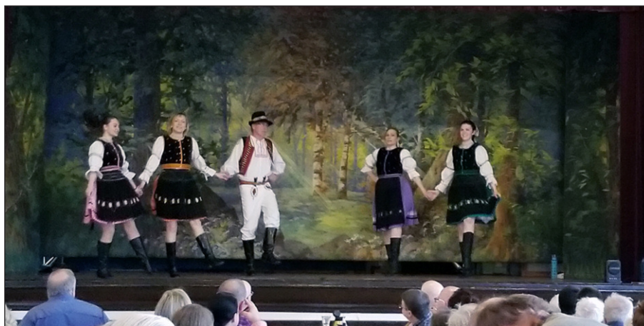
Flavors of Slovakia Dinner guests enjoyed the performance by the Lipa Slovak Folk Dancers.

What I enjoy most about our dinners is spending time with long-time friends, but I also find it exciting to share our Sokol event with new people who have new